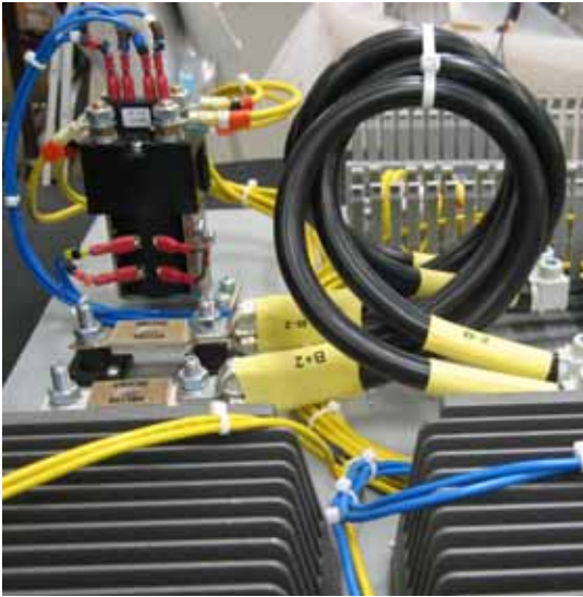
Vehicle harnesses and electrical cubicles

Our loom and harness manufacturing experience covers a wide diversity of: complexity, types and sizes of wires & cables, crimps, connectors and components. We also provide design and engineering assistance and prototyping.