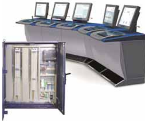
Control panels & cubicles

Our loom and harness manufacturing experience covers a wide diversity of: complexity, types and sizes of wires & cables, crimps, connectors and components. We also provide design and engineering assistance and prototyping.