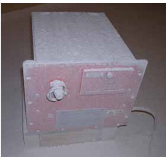
IP dust testing